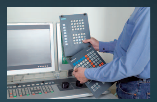
The conversion to another control system is carried out within a minute by calling up the respective software and by simply replacing the control specific keyboard module.

The result: All CNC technicians can be applied more flexibly. And this is a decisive plus: for the qualified employees as well as for the business.