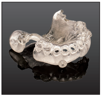
Clear Bio-compatible (MED610)

Transparent, bio-compatible material that is medically approved for temporary in-mouth placement.