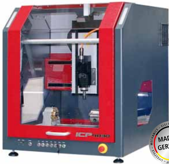
ICP 4030 with hood open

MECHANICS - ELECTRONICS - SOFTWARE - SYSTEMS MADE IN GERMANY LIFESTYLE - DISPLAY