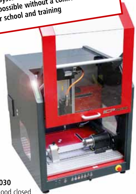
ICP 4030 with hood closed

MECHANICS - ELECTRONICS - SOFTWARE - SYSTEMS MADE IN GERMANY LIFESTYLE - DISPLAY