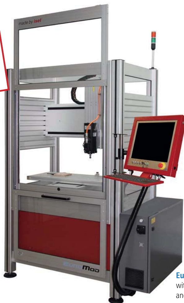
EuroMod MP 45 with control panel iOP-19-TFT and open sliding door