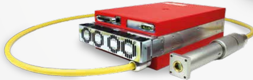
Fibre laser for marking up to 20 Watt