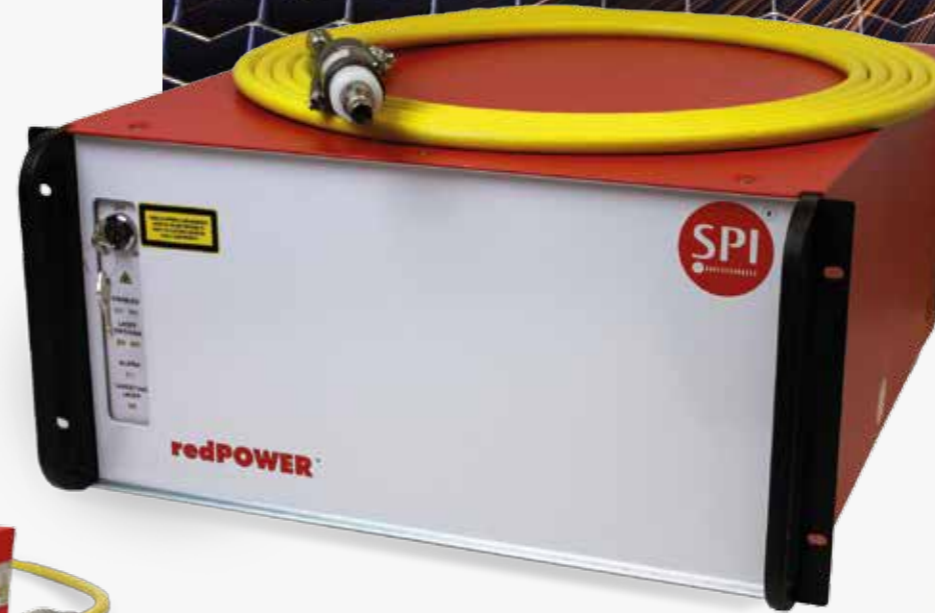
Fibre laser for cutting up to 4000 Watt