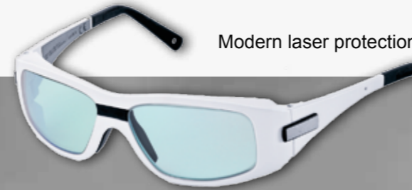
Modern laser protection glasses