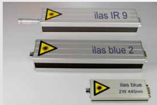
imes-icore ilas diode laser 2 to 9 Watt

The fundamental core piece of a laser system is the laser. The customer's planned application normally determines the selection of the laser source. In order to enable our customers to obtain the ideal combination of machine and laser source, we work with leading manufacturers of laser sources such as FEHA, SPI and IPG.