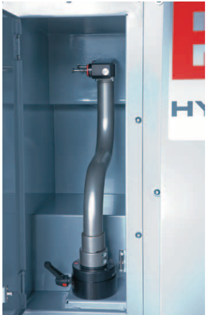
Storage location for the removable tool measuring arm

„We don't just blindly buy EMCO out of habit - we also use CNC machines from other manufacturers. However, for this range of parts in particular, there is simply no comparable two-spindle machine on the market that offers such a high level of precision from such a small footprint,“ says Johann Brisker, who is clearly impressed with the HYPERTURN 45. The fact that this Viennese company received the world's first HYPERTURN 45 should also not go unmentioned.