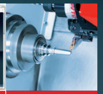
The aim: Learning to operate and program CNC machines safely for seamless industrial production

gned, multimedia teaching and learning materials. The course offered can be individually tailored by the trainers and expanded to include customized contents.