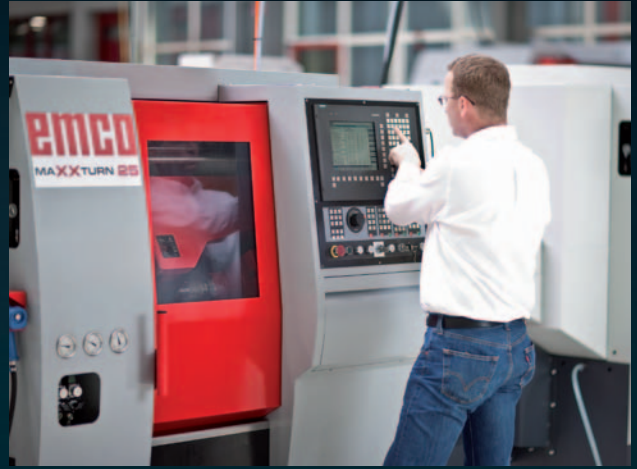
Transferring newly learned skills to industry and training machines

Customized courses and tailored contents, ongoing knowledge tests and interactive learning units quickly convey information in an easy-tograsp manner.