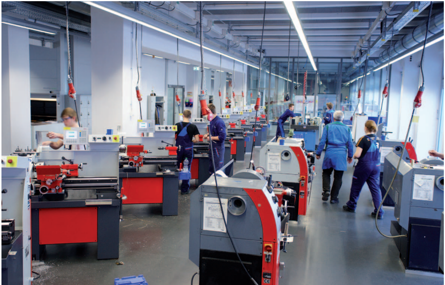
Every apprentice has his/her "own" Emcomat 14-D lathe for learning on.