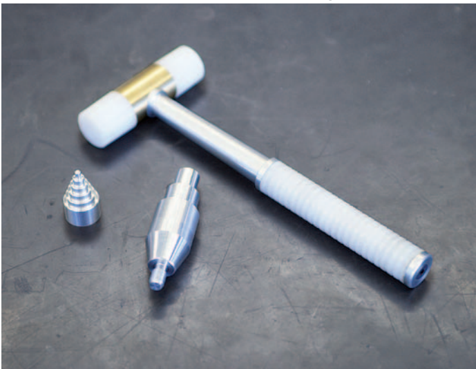
Three typical test workpieces for metal cutting training in the first year.

At present, 18 young women and 50 men are learning in the first year of a mechatronic engineering training programme. In the case of mechatronic engineers around 30% of the practical training involves metal training. In the first year of training two weeks are spent on cutting machining, and, in more depth, a further two weeks in the second year of training. In addition there are some days for preparing for the examination in the third year of training. In the two first weeks of the first year of training the focus is on three test workpieces: a stepped round pyramid, a cylinder with a cone and thread as well as a hammer. Whereas the pyramid and the cylinder are made of aluminium, the hammer is a mixture of plastics, aluminium and brass. The milled test workpieces are made of aluminium and steel. In the first instance the trainer assess how the apprentices transfer the geometries from the drawing into the reality of the workpieces and how well they adhere to the predefined precision. The precision target is h 7. The hammer can be acquired by its producer as a souvenir of his/her first solo metal cutting work.