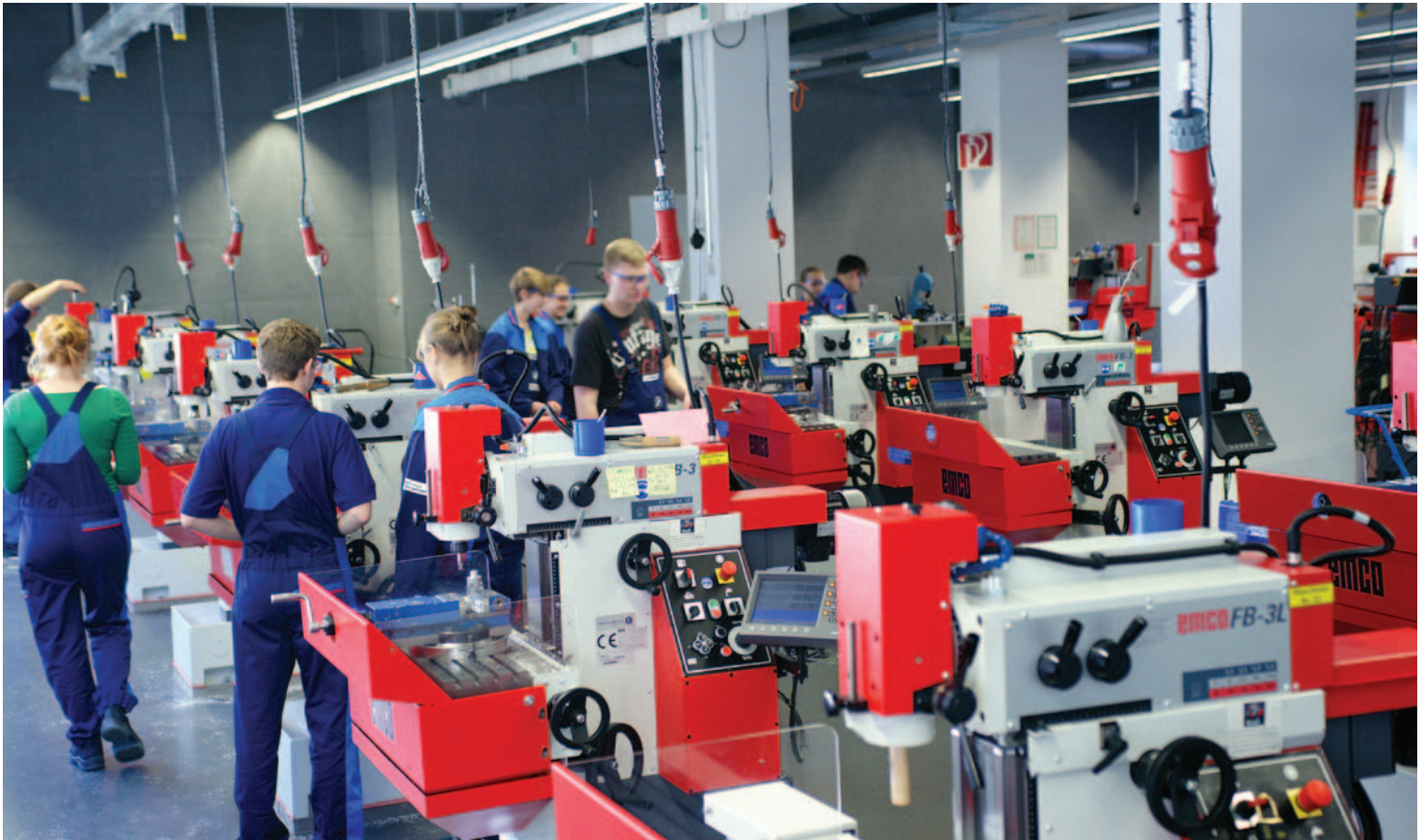
Apprentices produce their test workpieces on Emcomat FB-3 L milling machines.