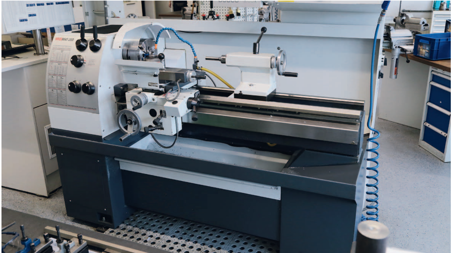
Emcomat-20 D universal turning machines with position display for saddle, cross slide and top slide – new as well and perfectly matched with Haidlmair's colour scheme.