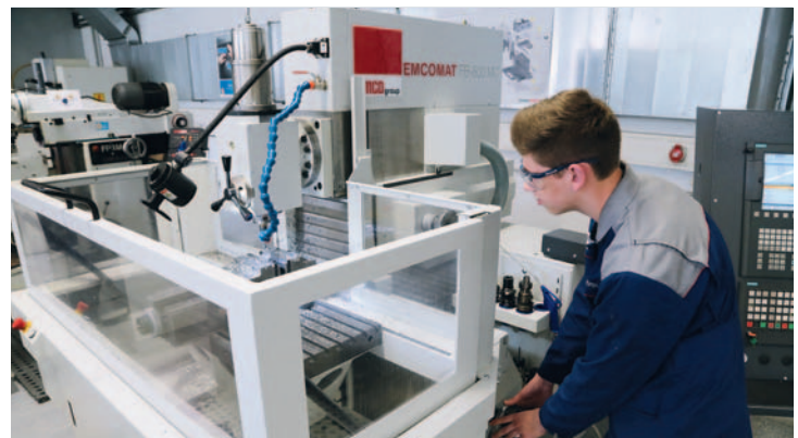
To Haidlmair, it was vital that the new universal milling machines would also allow for manual operation, especially for the area of vocational training.

While describing this possibility, you cannot fail to notice Eisterlehner’s enthusiasm, for he knows how important it is that apprentices obtain a clear picture of the application. The fact that Emco had catered for the training manager’s wishes by positioning the operating panel of the control lower than usual further facilitated the company’s decision. ‘Although this seems to be a minor detail, it is of utmost importance in the area of vocational training, because sometimes apprentices have not yet reached their full-grown height, which means they need a lower operating panel in order to be able to work in an ergonomic position,’ explains Rupert Lehener, responsible area sales manager at Emco.