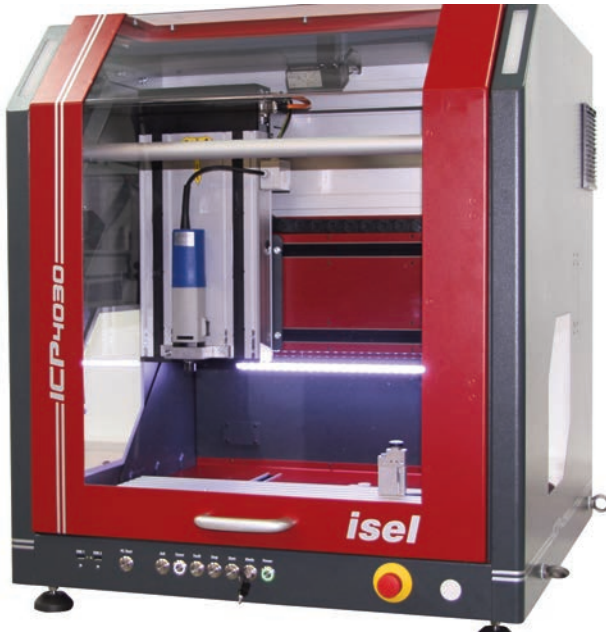
ICP 4030 with hood closed

MECHANICS - ELECTRONICS - SOFTWARE - SYSTEMS MADE IN GERMANY LIFE CYCLE - DISPLAY -