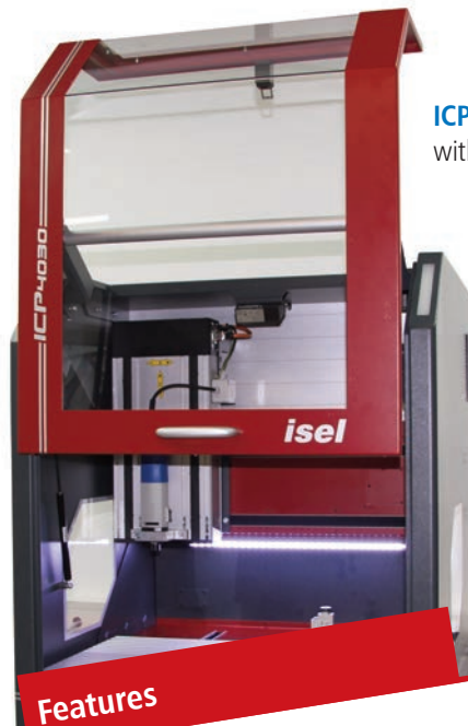
ICP 4030 with hood open