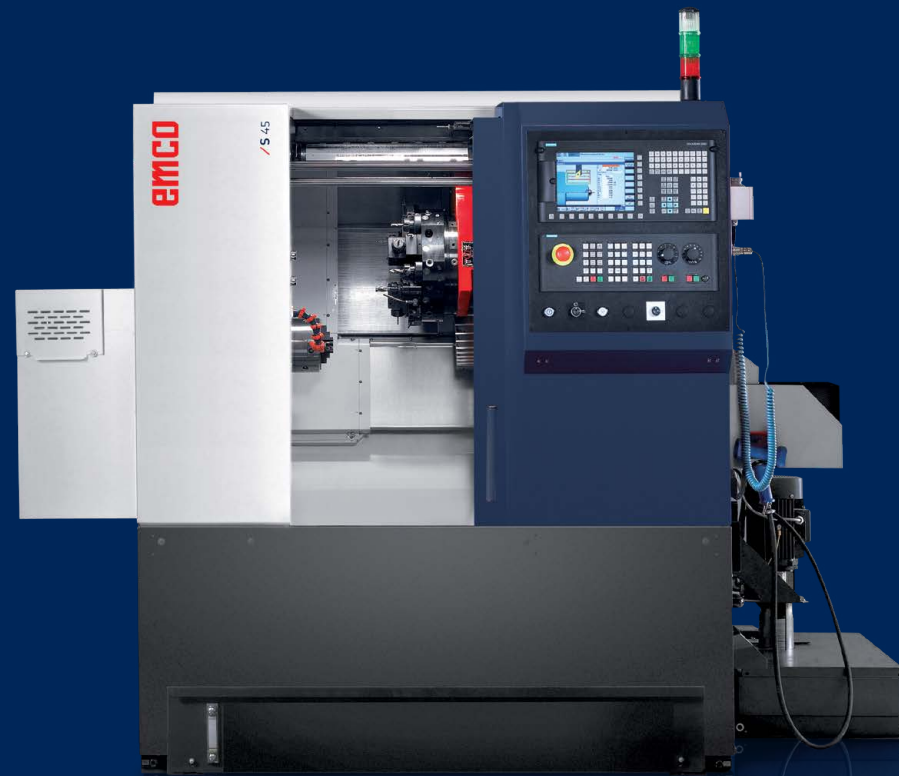
Machine with optional equipment

The compact CNC lathe with turn-mill turret is predestined for processing bar parts with a diameter of up to 45 mm and chuck parts of up to 220 mm. The main spindle features speeds of up to 6300 rpm and a main drive power of 11 kW. For shaft machining the machine is also available with an automatic tailstock. With an optimal accessibility the machine offers best conditions for the production of small lot sizes.