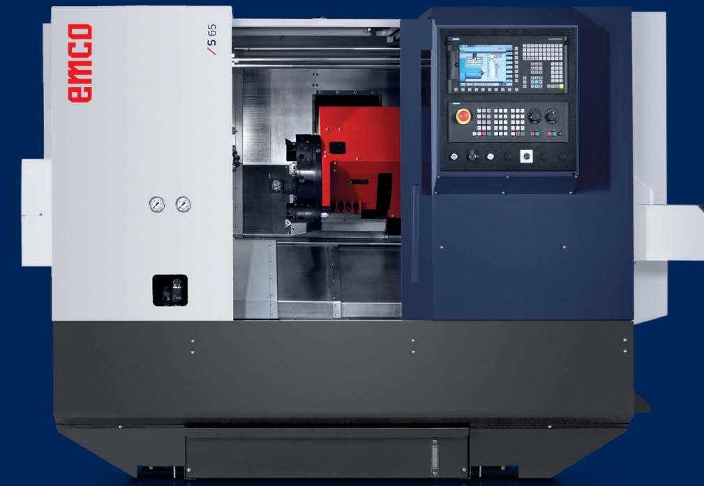
Machine with optional equipment

The compact CNC lathe with turn-mill turret is predestined for processing bar parts with a diameter of up to 65 mm and chuck parts of up to 310 mm. The main spindle features speeds of up to 4200 rpm and a main drive power of 18 kW. For shaft machining the machine is also available with an automatic tailstock. With an optimal accessibility the machine offers best conditions for the production of small lot sizes.