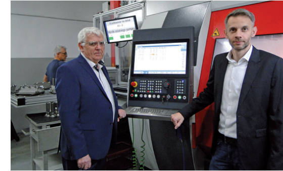
Owner and project manager of PROPART in front of the EMCOTURN E65

With the EMCO lathes of the EMCOTURN E65M series PROPART manufactures gear components for the automotive industry. In cooperation with the Austrian machine tool manufacturer, the company has developed a workpiece measuring device for the EMCO lathes, which is fully implemented in the process of machining car transmission parts by checking the relevant diameters and automatic correction of the cutting tools, thus increasing the quality of the parts. For PROPART, the main reasons for carrying out the project with EMCO were the individual technological solution offered by EMCO, EMCO's solution-oriented approach to the requirements, flexibility, direct access to EMCO designers and the transparent, mutual exchange of information and experience between the two companies. From the very beginning, EMCO has shown great interest and commitment to professional cooperation. Furthermore, the economic benefit for PROPART was an important factor. By implementing the workpiece measuring device, production costs in the company could be reduced and quality could be optimized (reduction of production defects by enabling the automatic dimension correction of the measuring device). The increased precision in the production of gear parts improves the quality of the parts and thus increases the competitiveness of PROPART. The automation of the machines solves the problem of the prevailing lack of skilled workers at least in certain areas and helps to reduce the personnel costs.