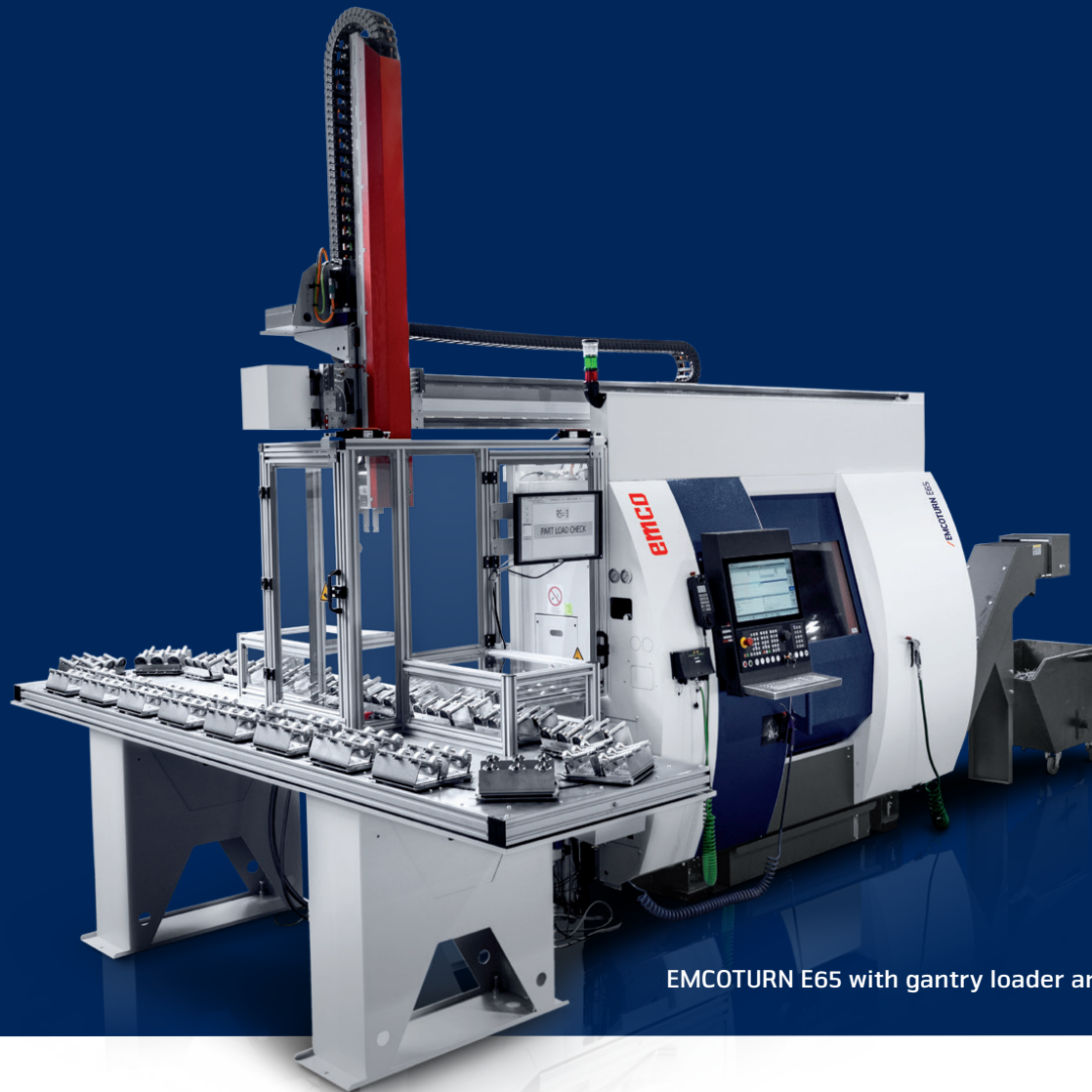
EMCOTURN E65 with gantry loader and workpiece measuring device